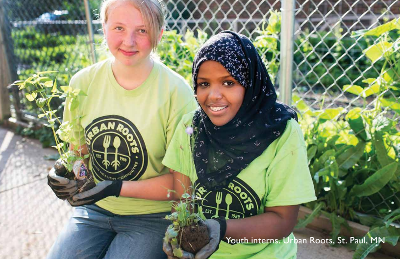
Youth interns, Urban Roots, St. Paul, MN